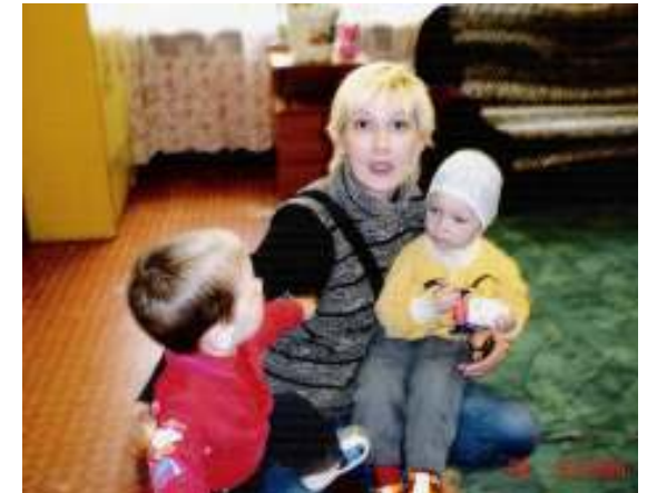
Working with orphans.

We currently have the use of the Juan Bonall Youth Center belonging to the Sisters of Charity of St Anne. We also have a two-room apartment that can be used for emergency needs. We make use of the facilities of Most Holy Mother of God Catholic Parish.