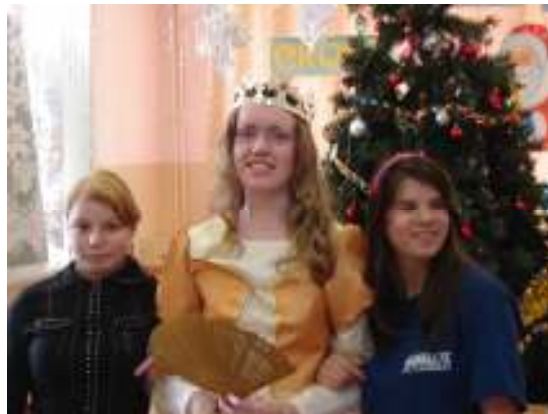
A student helping entertain needy youth.