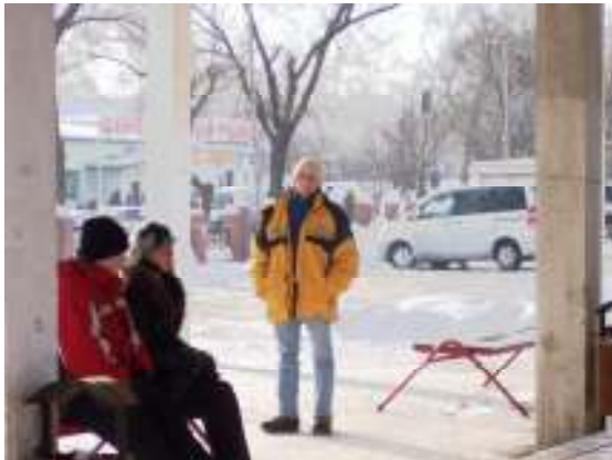
Long-term volunteer who teaches English.

The potential audience is the 70,000 strong student population of Vladivostok, the “third capital” of Russia, and Russia’s “San Francisco”, the goal of the TransSiberian railroad. Also involved are parishioners of Most Holy Mother of God Parish in Vladivostok, volunteers of Caritas and FOMIP (Russian charitable organizations), and anyone interested in our programs.