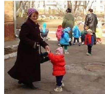
Some of the first Grandmas in Artyom.

For more on the Grandma Mentoring Program see our website or contact us at: